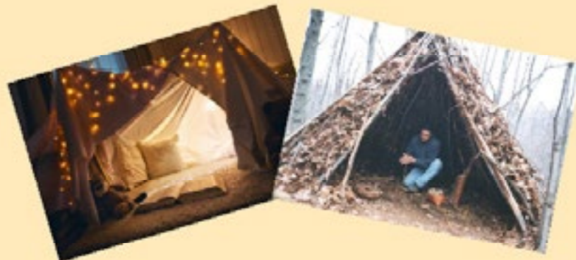
Lacey - 100 Adventures

If you're sleeping outside cover your den with leaves to keep the cold air out You'll need warm clothes if you're outside You may want a midnight feast so get your favourite snacks To make it extra cosy get all your blankets, pillows, teddies or even fairy lights! Bring a book, to help you get to sleep Take photos to make a scrap book Create a backpack of the things you may need