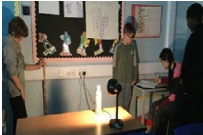
Year 6 science investigation

Preparations are currently underway for our end of year performance and the children are really excited about the opportunity to showcase their development throughout their time at Lakeview. Keep an eye out for some masked teachers and some devilish challenges set by the taskmaster themselves! In class, Year 6 have been working really hard and thoroughly enjoying reading the text 'Rooftoppers' by Katherine Rundell. They have engaged really well in asking questions and using drama to further understand the text, producing some outstanding pieces of writing as a result.